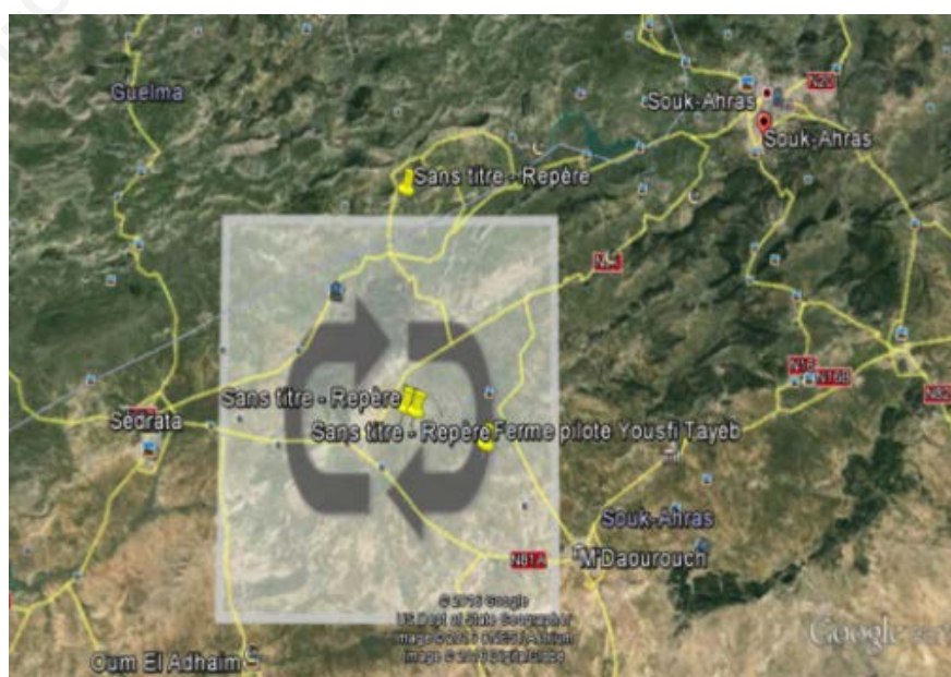
Figure 1. Satellite image of the experimental site: Youfsi Tayeb pilot farm, Algeria.

Averages with the same letter are not very different. Alpha: 0.05; Error Degrees of liberty: 2; Middle Square Error: 0.540357; Critical value of t: 4.30265; Smallest significant difference: 1.1954.