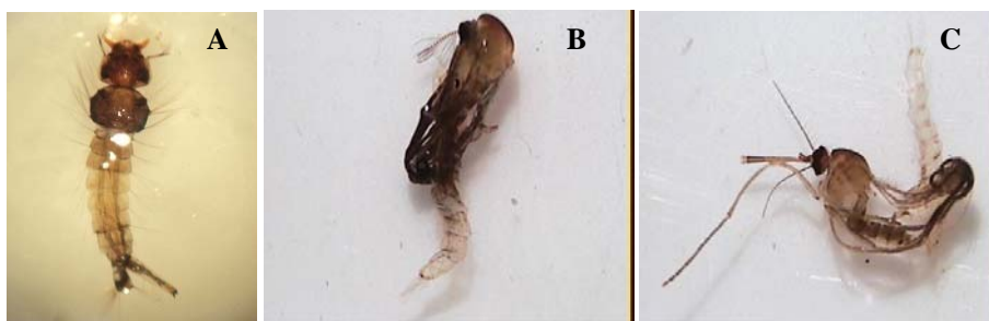
Fig 1: The morphological aberrations observed on larvae and pupae after treatment (A: doubled head larva, B: Inhibition of the exuviation pupae-adult, C: The adult undergoes a partial pupal ecdysis limited to the anterior part)